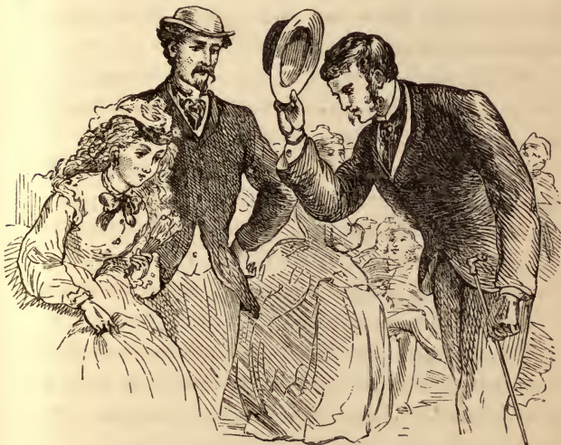
"Let me present my friend, Mr. Seymour."

Carryl came up with the lady on his arm; and as he stood there for a moment, in the coolest, most indifferent tone in the world, said, "Oh! by the by, Miss Ellis, let me present my friend Mr. Seymour."